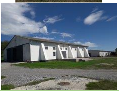
ADJACENT LANDOWNERS AND COMPANIES