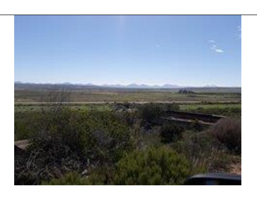
EXISTING STOCKPILES ON SITE – LANDOWNER STOCKPILES